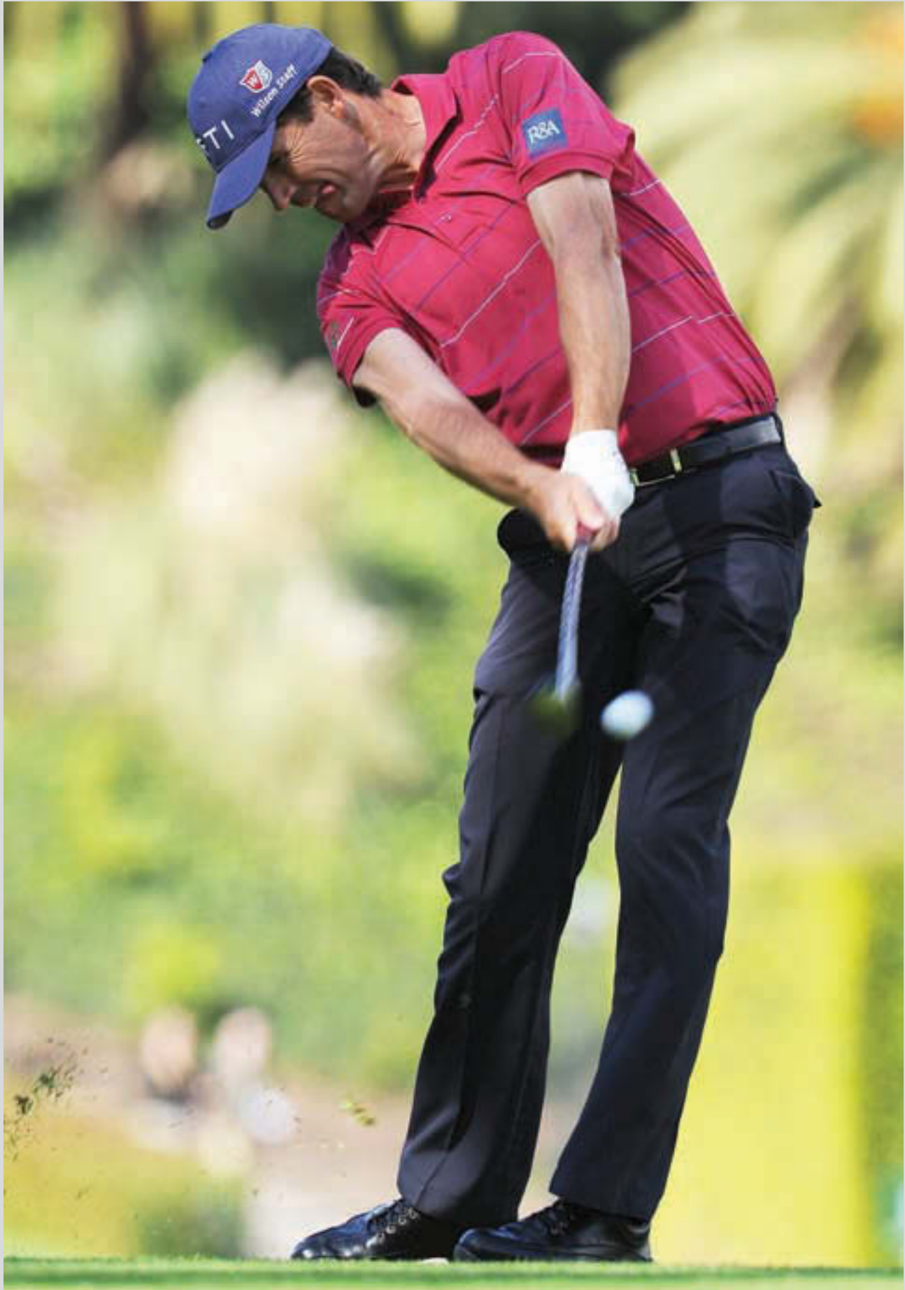
The R&A's first Working for Golf Ambassador, two-time Open Champion Padraig Harrington